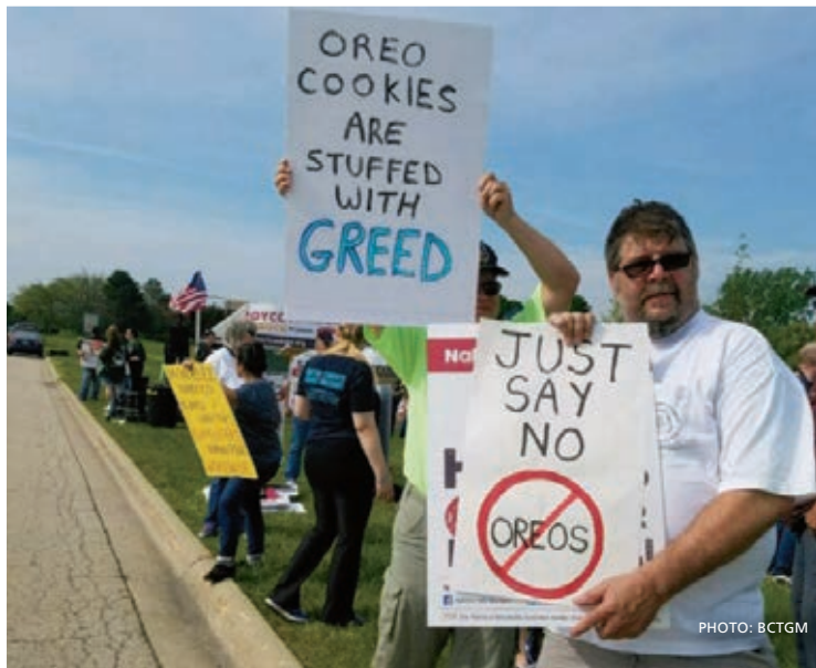
NABISCO WORKERS AND BCTGM MEMBERS ARE JOINED BY LABOR AND COMMUNITY ACTIVISTS AT THE MONDELEZ SHAREHOLDERS MEETING IN LINCOLNSHIRE, ILL. TO PROTEST THE OUTSOURCING OF AMERICAN JOBS TO LOW-WAGE COUNTRIES.

For more pictures and to watch a recording of the rally, visit http://www.fightforamericanjobs.org/bctgm-joined-by-labor-and-community-activists-for-nabiscosshareholdershowdown/ .