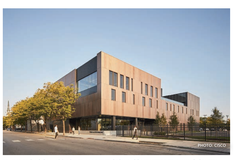
PLUMBERS LOCAL 130 JOINT APPRENTICESHIP COMMITTEE TRAINING CENTER RECEIVED AN HONORABLE MENTION FOR THE CONSTRUCTION INDUSTRY SERVICE CORPORATION'S PROJECT OF THE YEAR AWARD.

The CFL reserves the right to edit stories for content and space allowance.