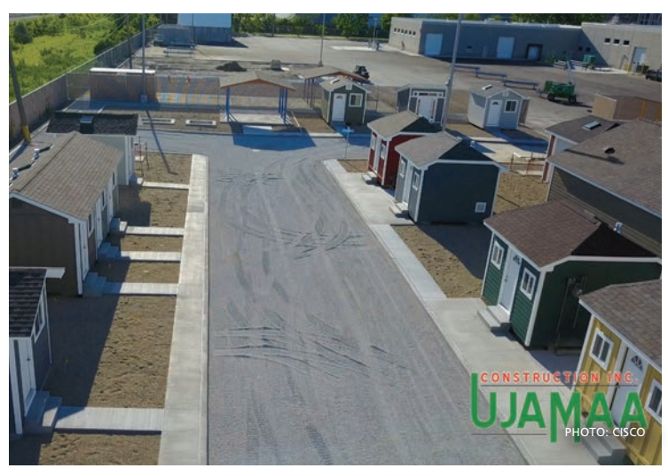
"GAS CITY"—A FULLY FUNCTIONING NATURAL GAS DELIVERY SYSTEM TO 20 "HOMES" AND "BUSINESSES"—AT THE NEW PEOPLES GAS TRAINING CENTER.