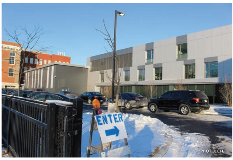
IBEW LOCAL 134 REHABS A FORMER CPS SCHOOL, DRAKE ELEMENTARY, TO BECOME THEIR NEW UNION HALL AND ADMINISTRATIVE OFFICES.

The grand opening for the new building is scheduled for Memorial Day weekend. Festivities will include a ribbon cutting ceremony on Friday, May 25 with local reporters, union leaders, including IBEW