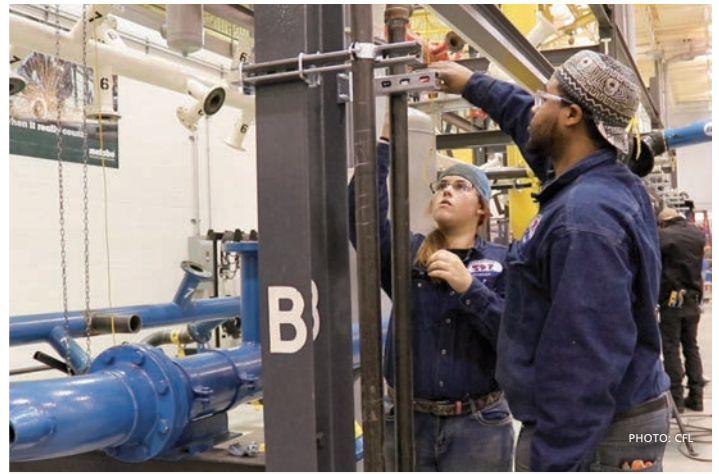
TWO APPRENTICES WITH PIPEFITTERS LOCAL 597 LEARN THE TRADE.

Access United partners include seven community organizations from across the city and three of United Way’s Neighborhood Network groups. Together these organizations seek to create a collective impact on low-income neighborhoods throughout the city and suburbs. When speaking about Access United resources and their potential impact