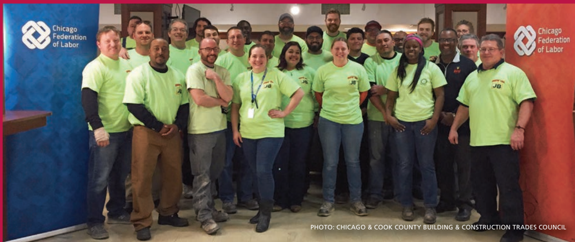
THE IBEW LOCAL 134 DELEGATES TO THE CHICAGO FEDERATION OF LABOR SHOW PRIDE FOR THEIR UNION AND THEIR SUPPORT FOR DEMOCRATIC GUBERNATORIAL CANDIDATE JB PRITZKER AT THE DELEGATES MEETING IN MARCH.