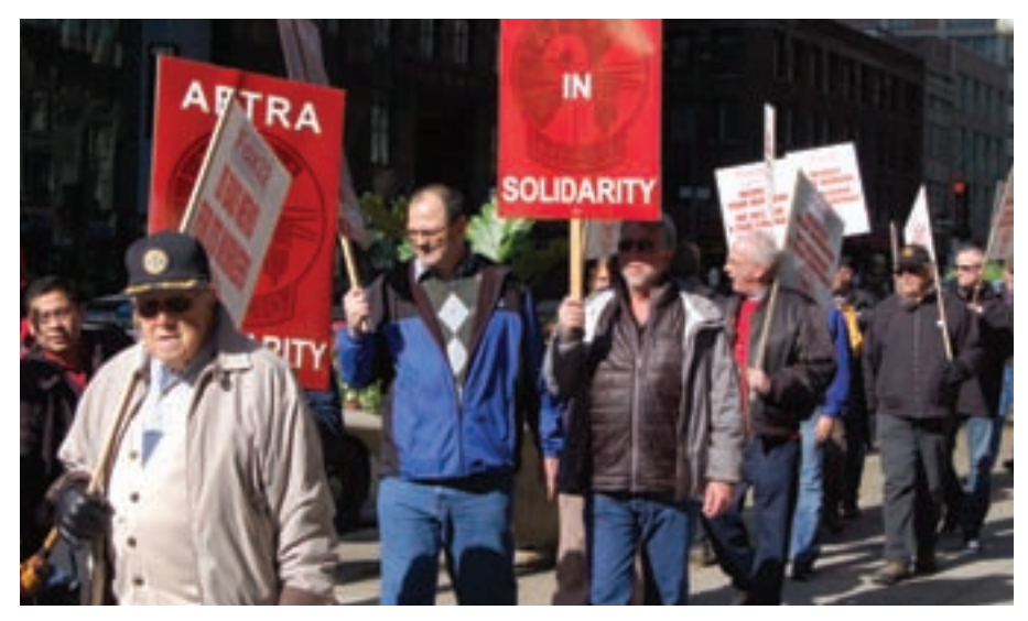
Union members march in solidarity for a new contract in front of television stations in Chicago

NBC tried to claim that it was consolidating work and creating new, non-union jobs. But the ruling said testimony at hearings this year in New York, Los Angeles, Chicago, and Washington, D.C., made it clear that socalled content producers were doing the same work they have always done, just with a different title.