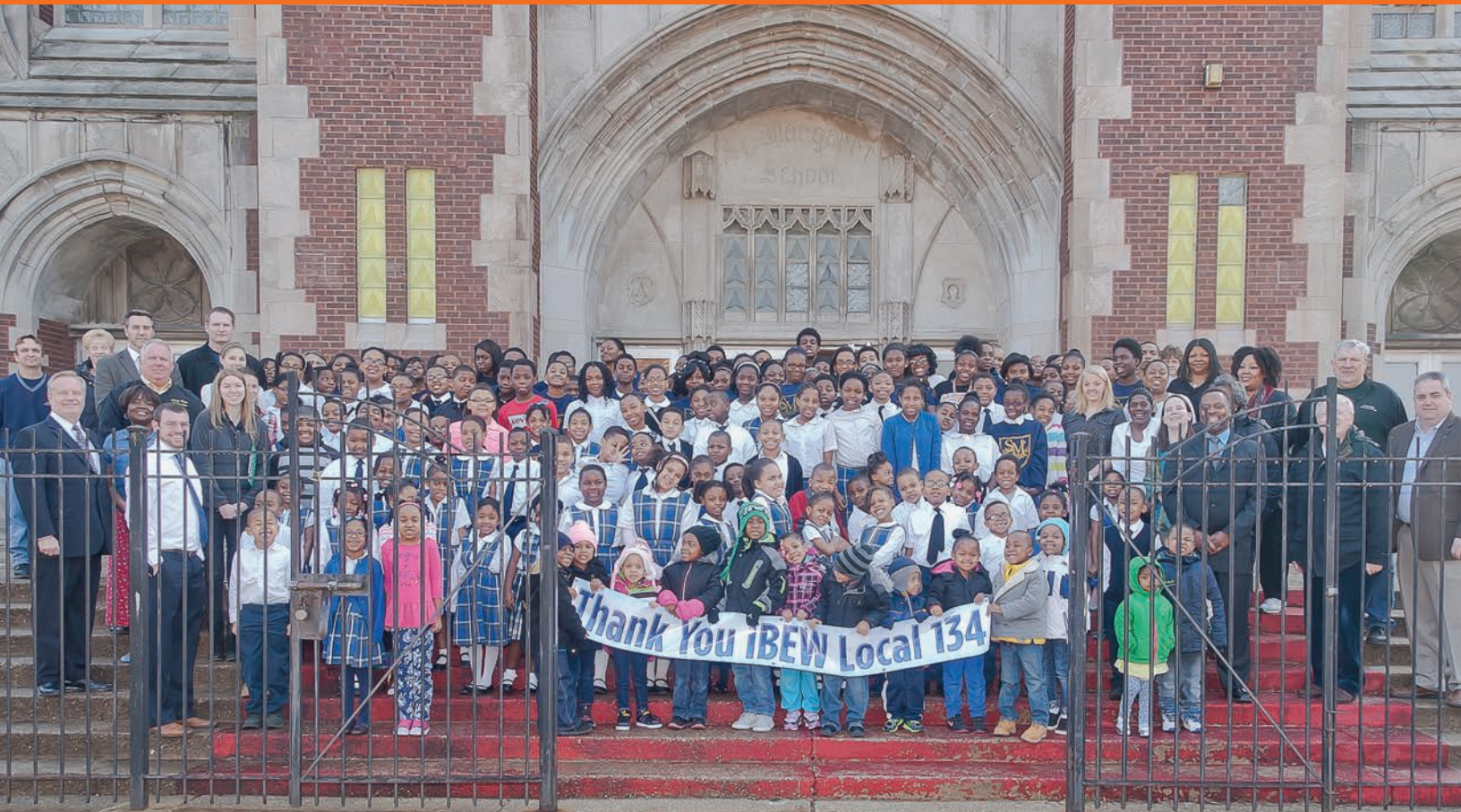
THE STUDENTS, FACULTY AND STAFF OF ST. MARGARET OF SCOTLAND SAY THANK YOU TO THE REPRESENTATIVES OF LOCAL 134 IN A BIG WAY.