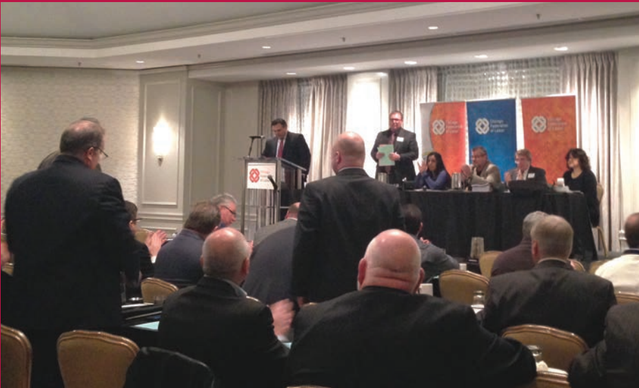
In January, the CFL convened the Committee on Political Education to endorse candidates for the March 2014 Primary Election.